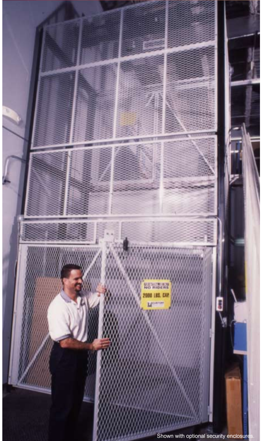
Shown with optional security enclosures.