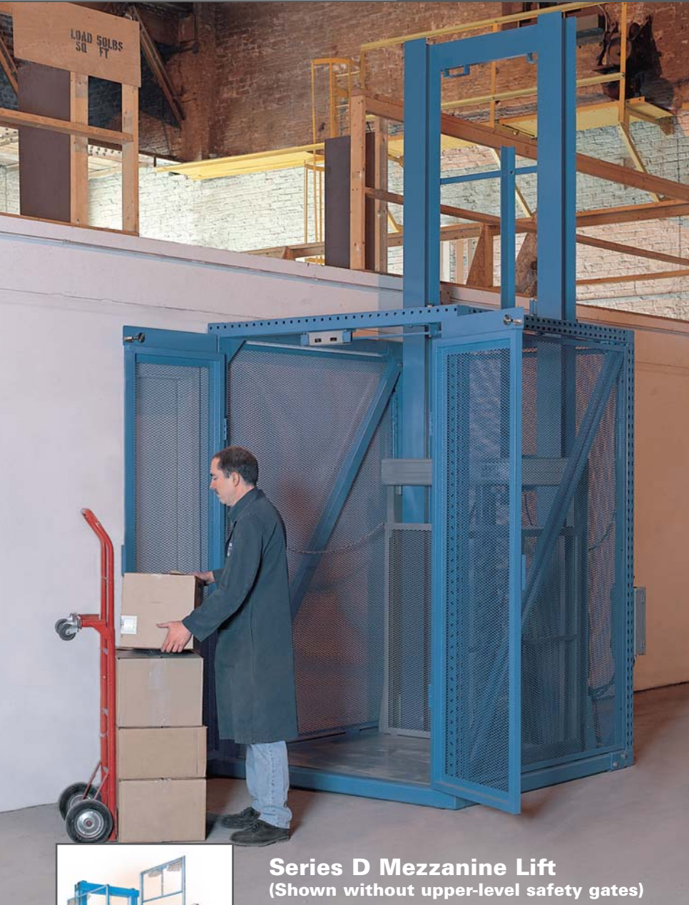
Series D Mezzanine Lift (Shown without upper-level safety gates)

As an option, the Pflow Series D Lift can be shipped as a self-contained unit equipped to service in-plant mezzanines. The Pflow Series D Mezzanine Lift is pre-assembled and shipped with lower-level enclosures and code-approved safety gates. The lift motor pump and controls are pre-wired for fast, easy, one-day installation.